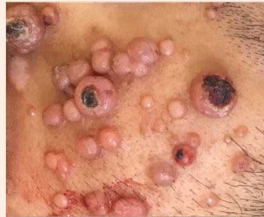
Figure 1: Elevated, umbilicated skin lesions rapidly developed and were documented in the upper extremities and dorsum.