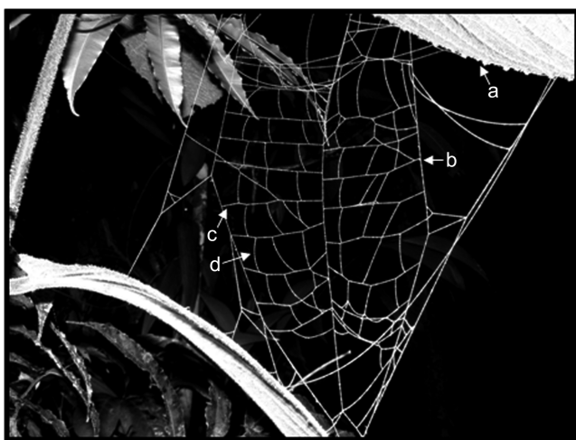
Fig. 1: Web (height 19 cm, width 13.5 cm) of an adult female of Synotaxus sp. powdered with cornstarch: a =leaf retreat; b =vertical frame thread; c =horizontal frame thread; d =sticky thread.

All webs ( n=53 , including webs not forming part of the censuses) were constructed in the understory of mature and old growth forests, between 20–70 cm above the ground. The height of webs ranged from 16–37 cm and the width from 13–27 cm. The web contained vertical non-sticky lines that extended from a relatively long, horizontal leaf that served as the spider's retreat, downward to other leaves below (Fig. 1: a–b). Horizontal dry threads connecting the vertical lines completed the network of non-sticky lines to which the spider attached the sticky threads (Fig. 1: c–d). There was a relatively dense tangle of thick, dry threads near the lower surface of the retreat leaf. This tangle was attached along part of the border of the leaf, forming a structure similar to an upside-down canoe. When resting, these green, slender spiders hung upside-down along the central vein of the leaf, and were very difficult to see. The webs constructed by juveniles ( n=2 ) were apparently similar to the adult