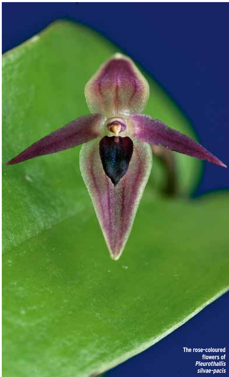
The rose-coloured flowers of Pleuroballis silvae-pacis