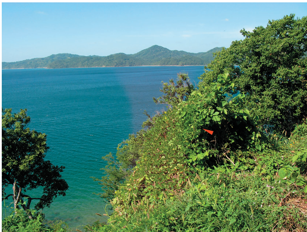
FIG. 3. Population #3284 growing on top of a cliff at Junquillal Bay, facing the Pacific Ocean (red arrow points to a couple of trifoliate leaves of a Phaseolus microcarpus vine covering the bush).