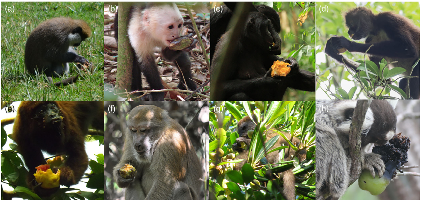
FIGURE 1 Wild primates consuming fermented fruits. (a) Chlorocebus djamdjamentis consuming L. abyssinica at Kokosa, Ethiopia; (b) Cebus capucinus imitator consuming D. oleifera at La Suerte Biological Field Station, Costa Rica; (c) Pan paniscus consuming A. mannii at LuiKatole, Democratic Republic of Congo; (d) Ateles geoffroyi consuming M. zapota at Punta Laguna, Mexico; (e) Alouatta guariba clamitans consuming P. guajava at Parque São Paulo, Brazil; (f) Macaca assamensis consuming N. cadamba at Phu Khieo Wildlife Sanctuary, Thailand; (g) Hapalemur meridionalis consuming Uapaca sp. at Mandena, Madagascar; (h) Callithrix jacchus consuming P. pachycladus at Baracuhy Biological Field Station, Brazil