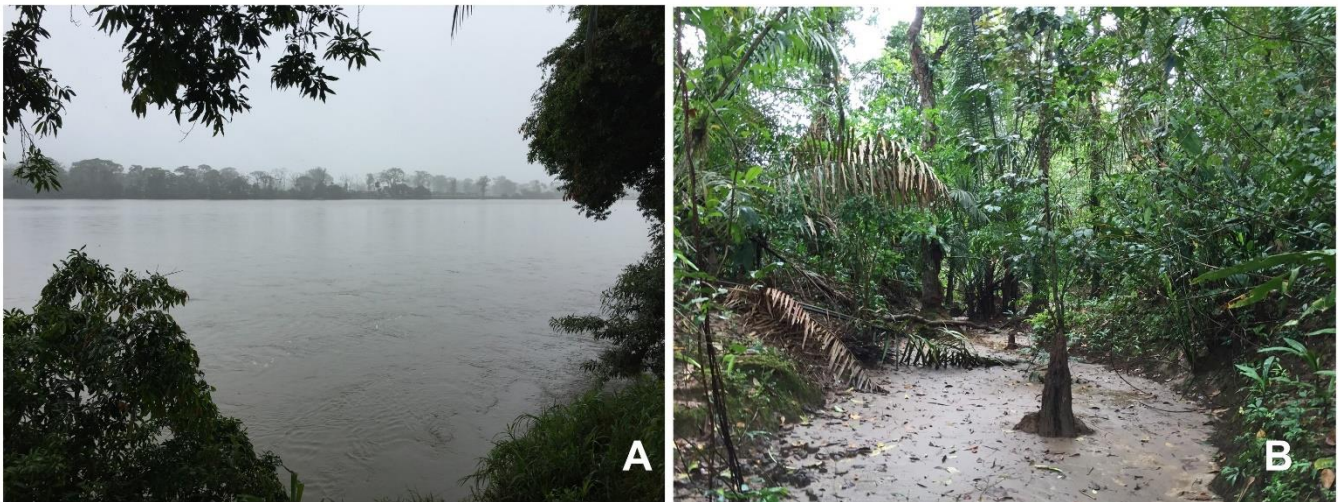
Figure 2. Images of the Río Colorado dividing Isla Calero and Isla Brava (A) in the northeastern wetlands of Costa Rica, and one sampled perhumid forest (B). Note that the survey was carried out during the “dry” season in January of 2016 even though the images may look like obtained during the wet season.

Recorded in both Isla Calero and Isla Brava (DCR, IC3 and IB2). No vouchers were collected.