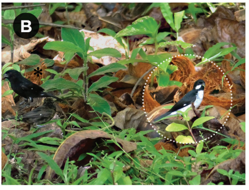
Figure 1. Male Lesson's Seedeater Sporophila bouvronides, Tortuguero, Limón province, Costa Rica, June, with a male Variable Seedeater Sporophila corvina (*)